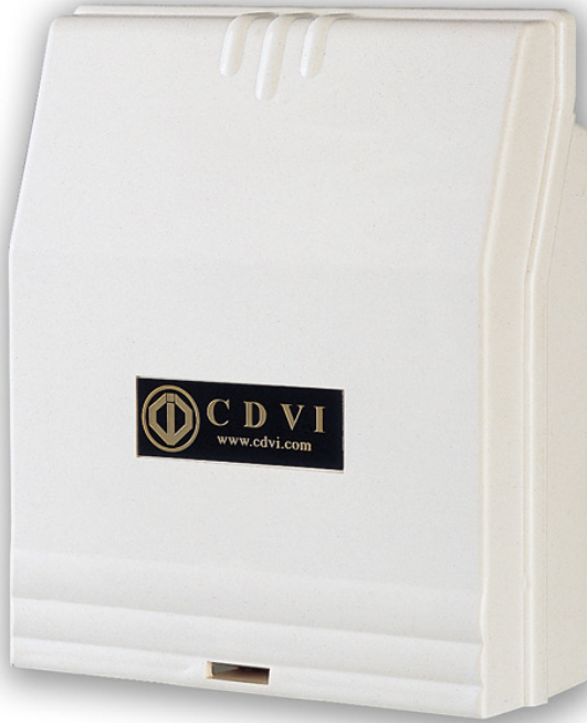
REMOTE ELECTRONIC UNIT

The GALEO keypad is available in 1, 2 or 3 relay output. Refer to page 5 for for the instruction of version 2 and 3 relay of the GALEO.